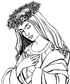
May Month of The Blessed Mother

Our annual vacation bible school program is scheduled for June 22 –26. Our theme this year will take us on an African Safari as we Explore the Kingdom of the Son . Adventurers will embark on a journey into the pages of God's Word and discover the greatest adventure of all – getting to know God. More information on registration and volunteer opportunities will follow in the next few weeks. Stay tuned! Oh, and don't forget to save the date!!!